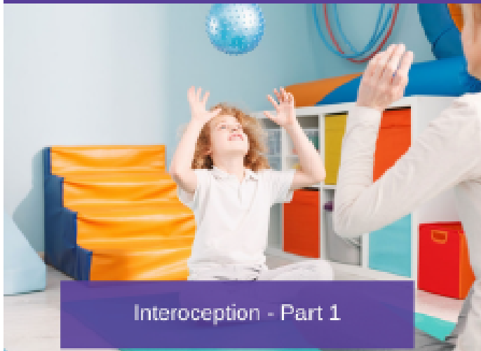
Interoception - Part 1